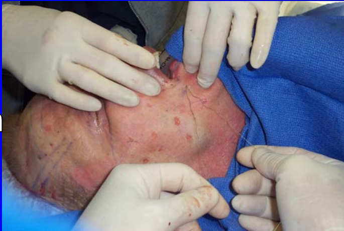
Corner of mouth